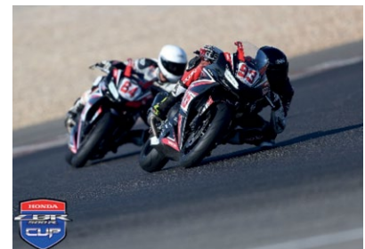
The CBR500R Cup.

It's not rare to find some CB500s proudly boasting more than 180,000 miles but the long-time favourite of the couriers and the driving school is much more than just a workhorse. Beginning in France in 1996, the CB500 Cup spread across Europe quickly. Since 2014, it is the CBR500R that young talents try to make a name by themselves on a budget. Sebastien Charpentier or James Toseland, to name a few, started there.