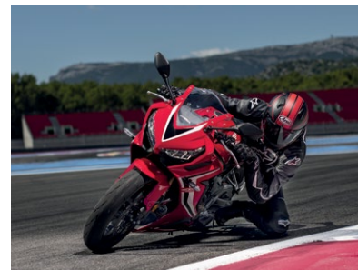
The CBR650R in action.

Since 1999 with the ST1100 Pan European, Honda have equipped more and more of its motorcycles with a system called Honda Selectable Torque Control (HSTC). This system constantly monitors the speeds of the front and rear wheels via speed sensors incorporated into the Anti-Lock Braking System (ABS). When the rear wheel begins to rotate significantly faster than the front, the systems reduces fuel delivery to the engine, limiting rear-wheel slippage. In 2019 with the new CBR650R, Honda applied this technology to its mid-displacement Supersport motorcycle for the first time.