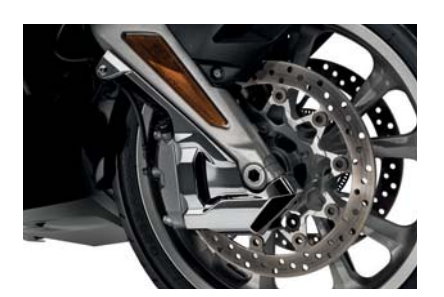
FRONT CALIPER COVERS 08F73 or 08F74-MKC-A00

Add some styling and additional cooling airflow to your front callipers with these covers.