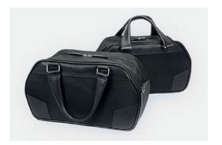
SADDLEBAG INNER BAG 08L01-MKC-A00

Helps to keep your trunk organised with convenient storage pockets for smaller items.