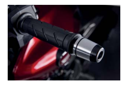
GRIP END SET 08F71-MKJ-E50

Meter visor fitted with a high quality aluminium panel to enhance the iconic look of the CB1000R.