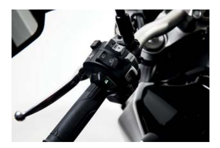
HEATED GRIPS* 08T70-MKJ-E50

Featuring a slim design to fully integrate with the CB1000R, the heated grips are controlled through a 5-position switch on the left side grip.