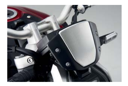
METER VISOR* 08R71-MKJ-E50

Meter visor fitted with a high quality aluminium panel to enhance the iconic look of the CB1000R.