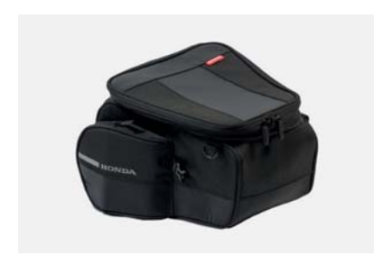
REAR SEAT BAG 08ESY-MKP-RRSEAT

A simple and functional tank bag adapted to the tank shape of the CB500F. Thanks to its specific attachment the tank bag does not disturb the handling of your bike. The Clear pocket on the top of the bag makes smartphone storage easy. A rain cover is included