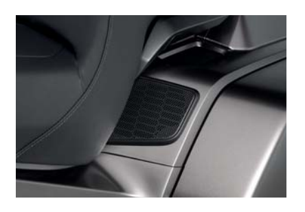
REAR SPEAKER PACK 08ESY-MKC-RR21

Pair of 25-watt speakers expanding the audio system of the Gold Wing (without Trunk). The Rear Speakers are installed within the saddlebags of the Gold Wing.