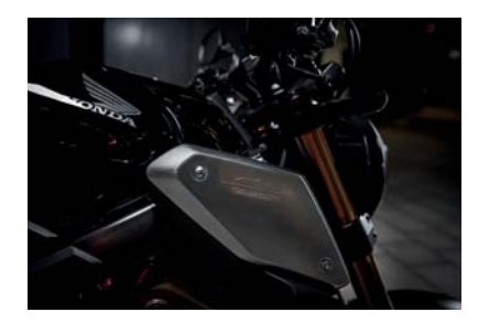
SHROUD COVERS 08F74-MKN-D50

Pair of aluminium panels designed to fit the front fender and give your motorcycle the ultimate Neo Sport Cafe look.