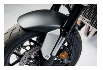
FRONT FENDER PANEL* 08F79-MKJ-D00

Give your CB1000R some additional protection with this set of grip ends which will help protect your bike in the event of a fall.