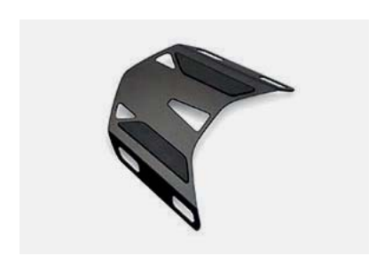
REAR CARRIER 08L70-MKC-C40

The Rear Carrier Kit can be installed on the Gold Wing variants without a trunk. With its black finish and rubber inserts, it adds style and functionality.