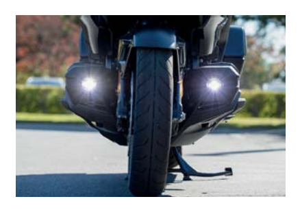
FRONT LED FOG LIGHTS 08ESY-MKC-FLK18

This pair of adjustable, bright white LED Fog Lights Increases the rider's visibility and makes them more noticeable for the surrounding traffic. Delivers 880 Lumens and features a hard-coated lens to tackle all riding conditions.