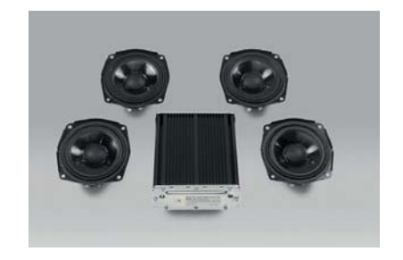
POWER AMPLIFIER PACK 08ESY-MKC-AMP22

Pair of 25-watt speakers expanding the audio system of the Gold Wing (without Trunk). The Rear Speakers are installed within the saddlebags of the Gold Wing.