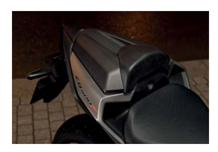
SEAT COWL 08F76-MJW-J00ZF

Custom-shaped Seat Cowl that replaces the standard pillion seat for a more sporty look.