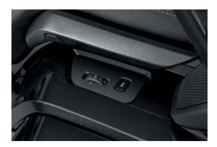
PILLION AUDIO SWITCH 08A70-MKC-A00

Set of 4" speakers with an amplifier specifically designed to provide clean and crisp music for the ultimate audio experience on the road.