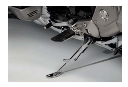
CHROME SIDE STAND 08M70-MKC-A00

A Chrome-plated Side Stand to add an additional premium touch to your Gold Wing.