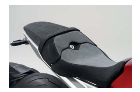
PILLION SEAT (ALCANTARA) 08F77-MKJ-E50

Made of luxurious Alcantara material, this rider seat brings the ultimate level of comfort and seating stability.