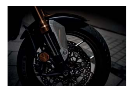
FRONT FENDER PANEL 08F73-MKN-D50

Pair of aluminium panels designed to fit the front fender and give your motorcycle the ultimate Neo Sport Cafe look.