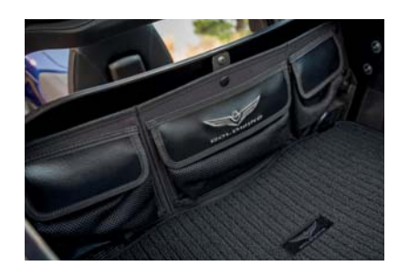
TRUNK LID ORGANISER 08L78-MKC-A00

Helps to keep your trunk organised with convenient storage pockets for smaller items.