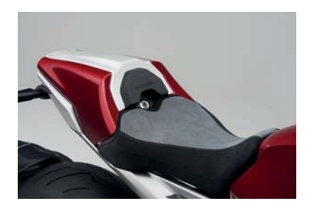
RIDER SEAT (ALCANTARA) 08F76-MKJ-E50

Featuring a slim design to fully integrate with the CB1000R, the heated grips are controlled through a 5-position switch on the left side grip.