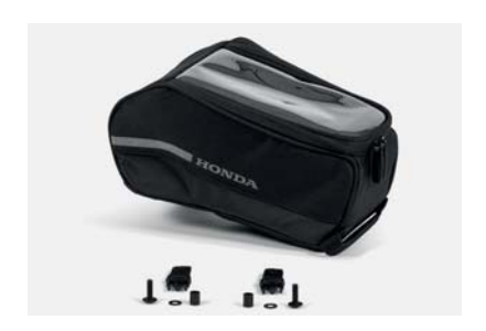
3L TANK BAG 08ESY-MKP-TKB19

A simple and functional tank bag adapted to the tank shape of the CB500F. Thanks to its specific attachment the tank bag does not disturb the handling of your bike. The Clear pocket on the top of the bag makes smartphone storage easy. A rain cover is included